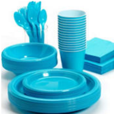
Plastic plates, etc.