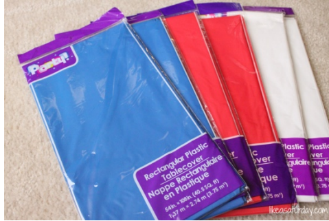
Plastic Table Cloths