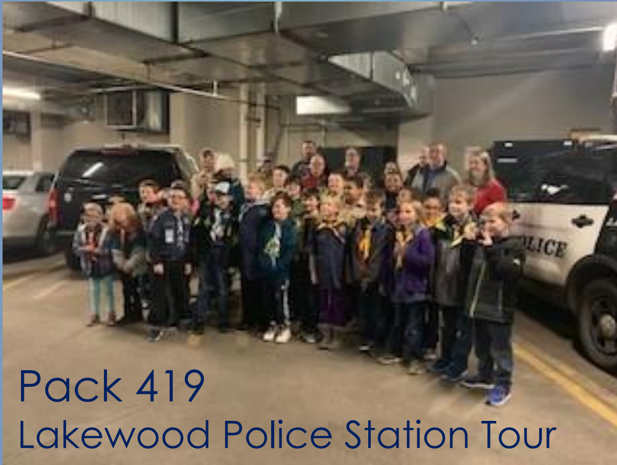
Pack 419 Lakewood Police Station Tour